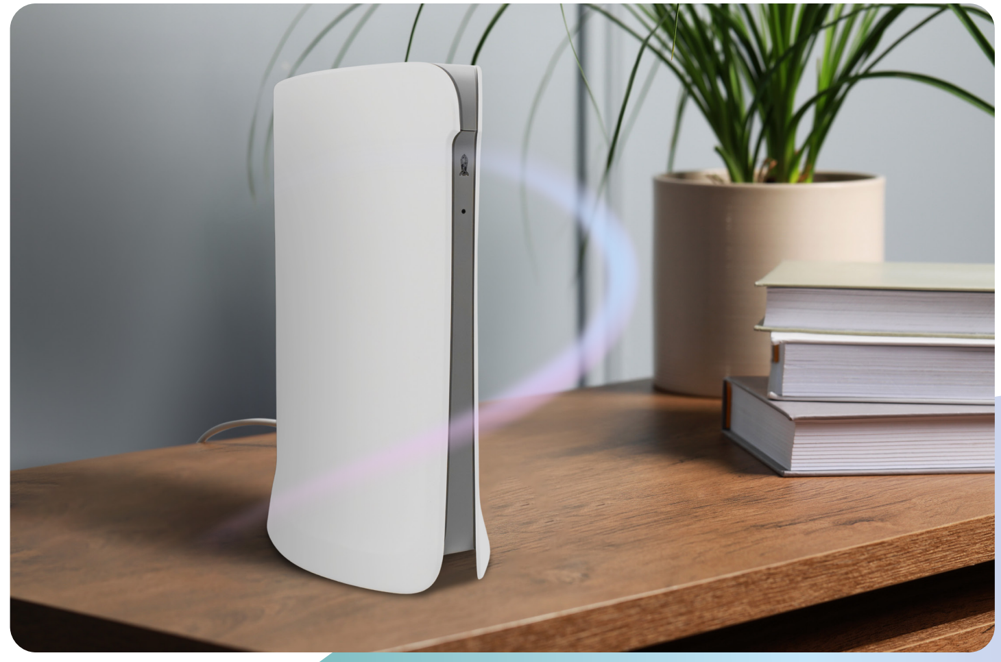
Table 2: Wildanet customers without Mesh WiFi or parental controls.